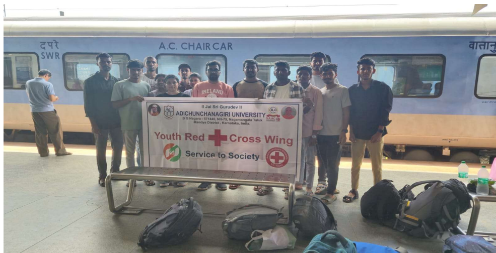
ACU-YRC youth red cross Unit on return journey from Mangalore to the University.