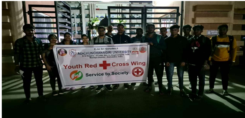
ACU-YRC youth red cross Unit at the start of the journey from Adichunchanagiri University to attend the YRC camp in Bengaluru.

Eighteen students, accompanied by the nodal officer, departed from Adichunchanagiri University by train on 19th September 2024 and arrived at Mangalore. The return journey was undertaken on 23rd September 2024.