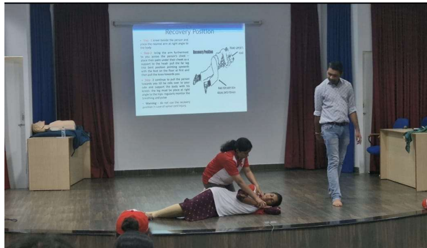
Training on key points to be noted during the first aid