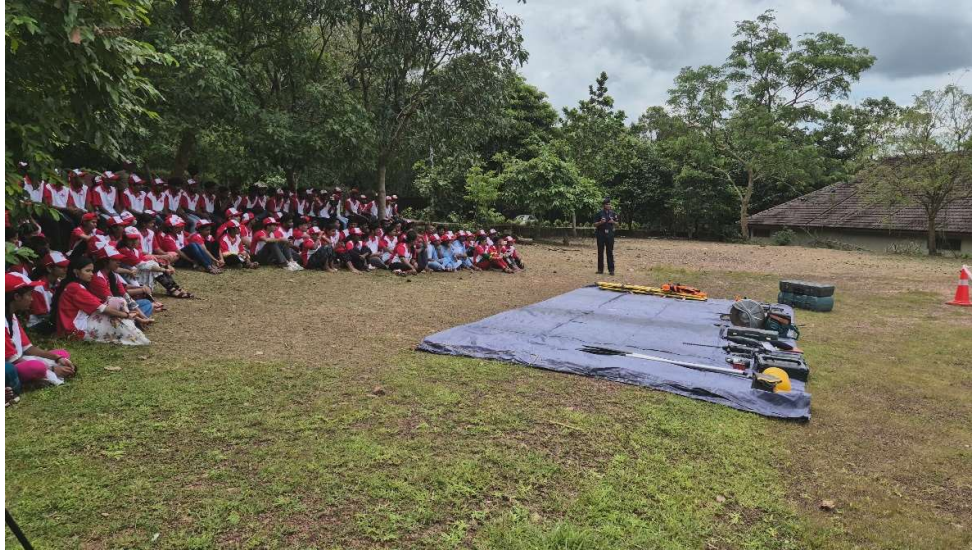
Students are given demo on Disaster management during various events such as earth quake